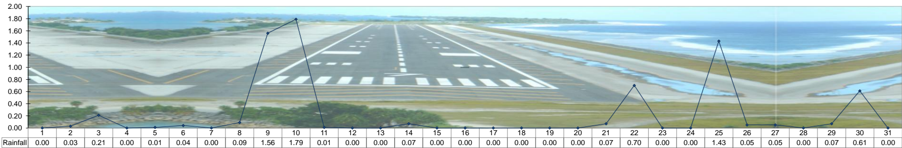
Rainfall Collection (inches)