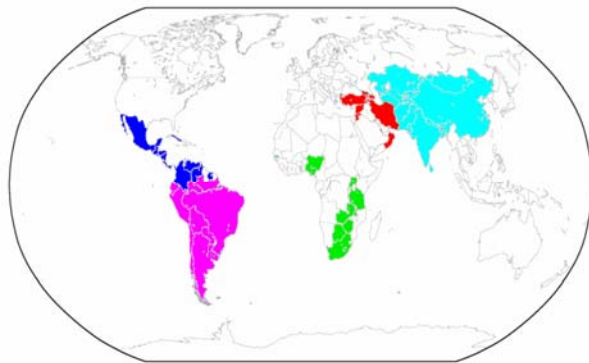
Figure 2. World map showing the countries participating or expected to participate in the five regional workshops.

The ETCCDMI sought to improve and extend those workshops to cover more of the world. The prime limiting factor, however, was financial support. Thanks to funding from the U.S. State Department, with the author as Principal Investigator (P.I.), and SysTem for Analysis, Research and Training (START) and the World Climate Research Program (WCRP), with Bruce Hewitson (South Africa) as P.I., adequate resources have become available to hold five workshops.