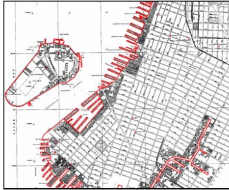
Vectorized Lines Added